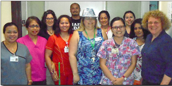
General Acute Care Unit (GAC)