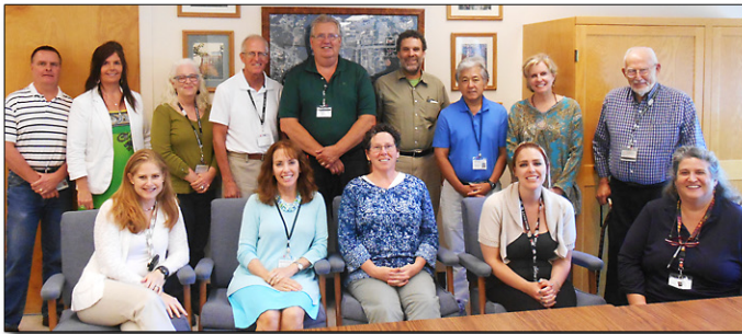
Department of Medicine