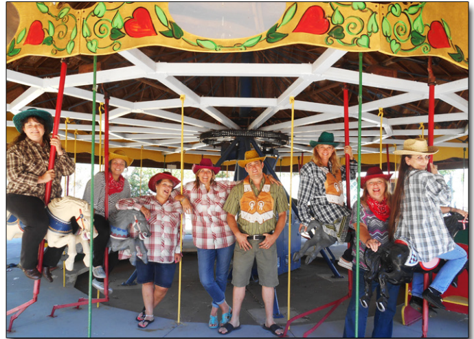
Program 4 management