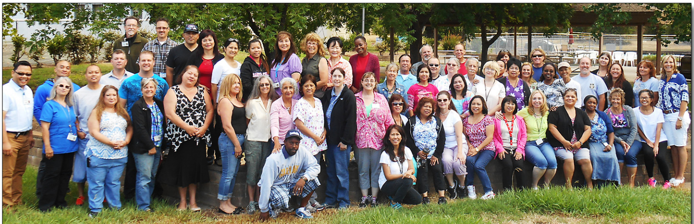
Central Program Services (CPS)