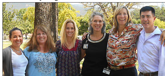
Employee Recognition Committee