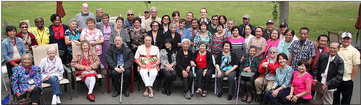
Foster Grandparent/Senior Companion Program