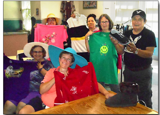
Impressions Clothing Store