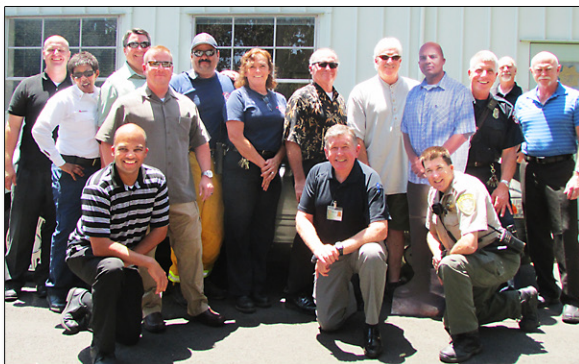
Office of Protective Services